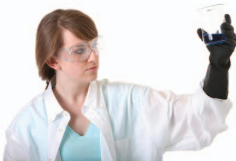
Heavyweight chemical latex glove

It should be noted that permeation and degradation tests are carried out under laboratory conditions and that real life working applications will vary. Gloves should be removed and disposed of according to manufacturer’s instructions.