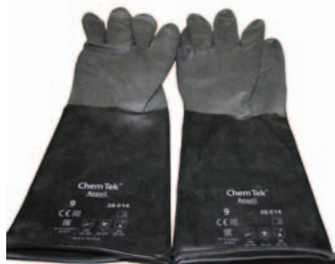
Butyl/viton glove with CE marking