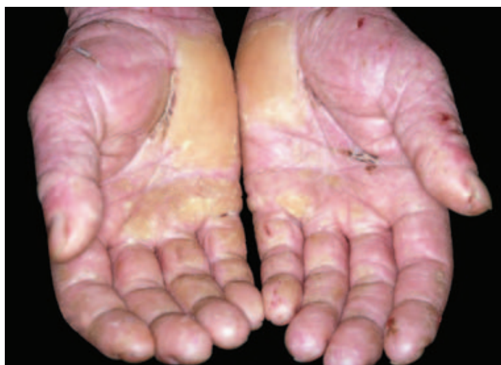
Dermatitis on worker's hands

Further information is available in manufacturers' charts, which indicate properties and performance details of the differing gloves to help make an informed decision on glove selection.