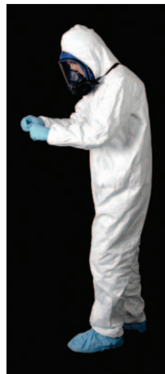
Disposable chemical suit

The clothing has a limited lifespan. If the product is torn or punctured it is difficult to avoid potential chemical exposure. Suits must be disposed of when damaged as they will no longer give the relevant protection to the worker.