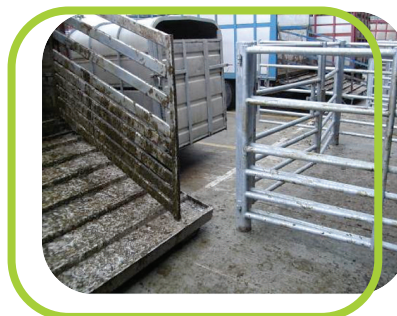
Position the trailer to avoid gaps like this

When the ramp is lowered to unload, step well to the side in case a stampede occurs. Be patient and don't rush them as they will always want to leave the trailer.