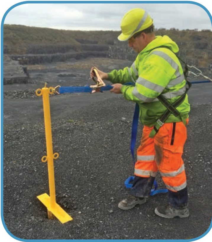
Strap and Pole system being erected and tensioned by a person using a harness with inertia reel lanyard