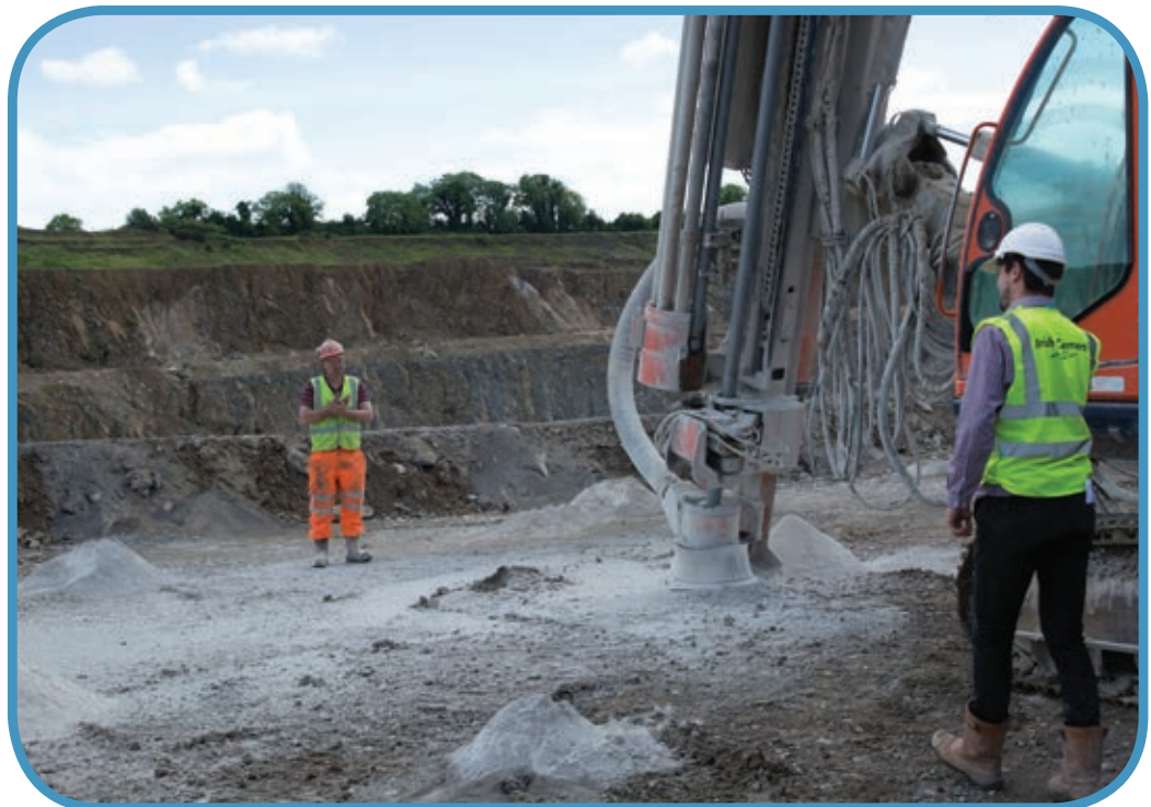
Quarry Workers marking out drill holes with fall protection provided by bunded edge protection made from quarried material