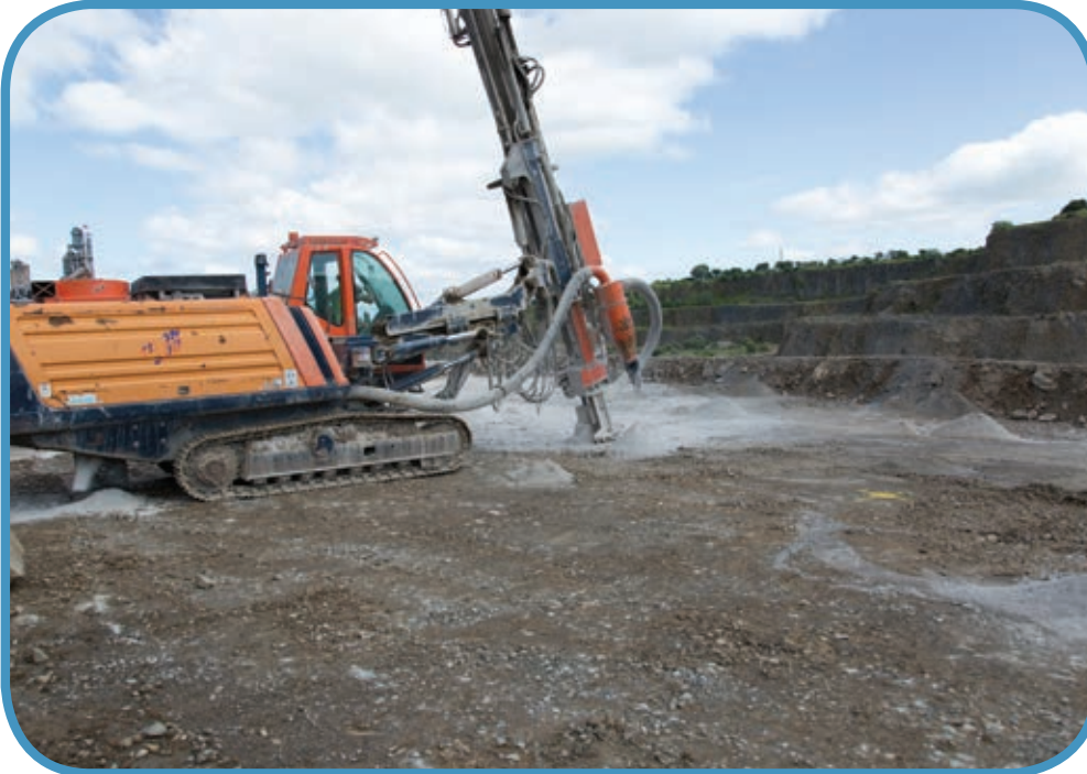
Drill Rig Operator working at a Quarry Face with fall protection provided by bunded edge protection made from quarried material