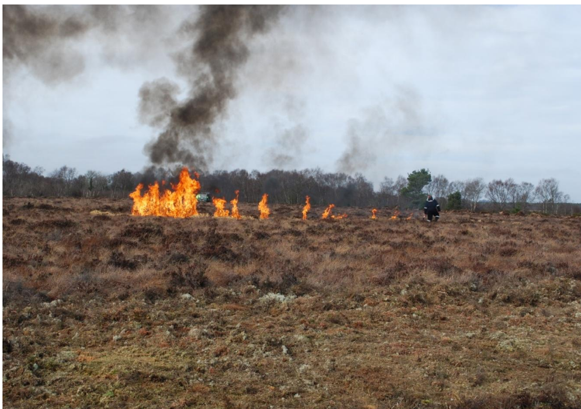
Prescribed burning operative igniting vegetation using a kerosene drip torch. Petrol or other highly flammable accelerant should never be used to start fires.

produce a relatively fast but controllable 'head fire' that will burn off fine surface vegetation without over-heating surface soil layers.