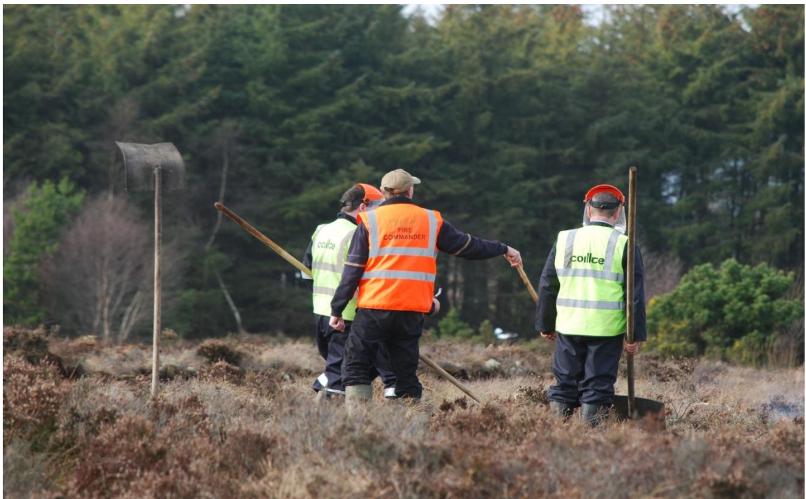
Coillte Supervisor briefing operatives in advance of burning at a prescribed burning exercise

Landowners/managers should familiarise themselves with the requirements of The Safety, Health and Welfare at Work Act, 2005 and Safety, Health and Welfare at Work (General Application) Regulations, 2007 and ensure compliance with legislation.