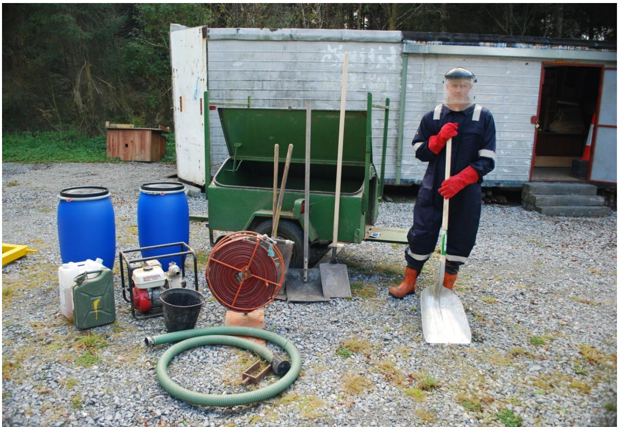
A suitably well-equipped prescribed burning operative and equipment.

On completion of the operation, equipment should be checked and serviced ready for future use, or in the event of emergency.