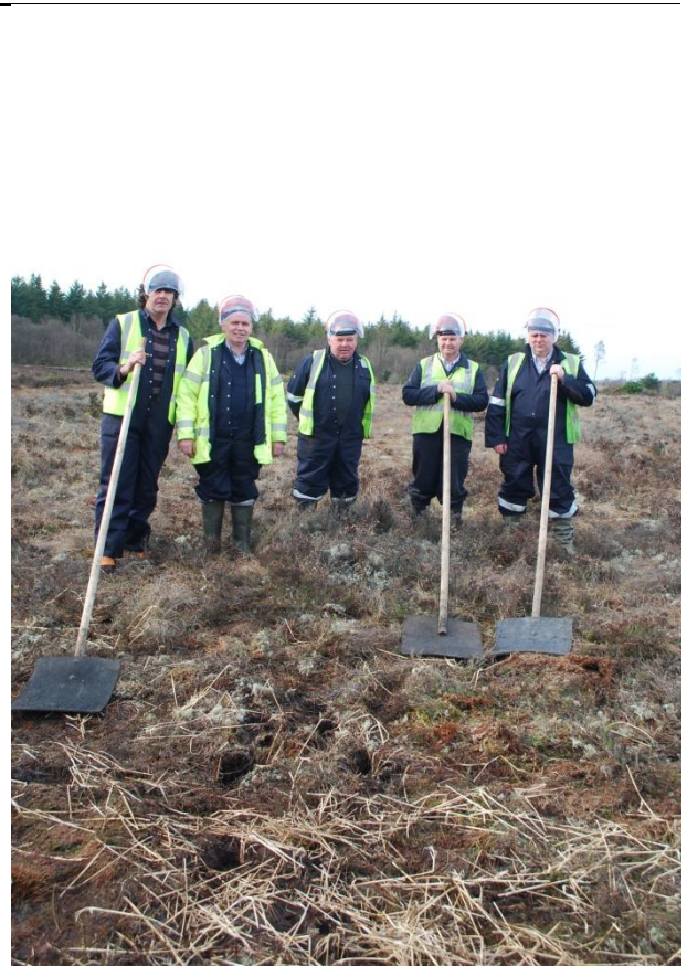
Correct Personal Protective Equipment must be worn at all times by all operatives and supervisors.