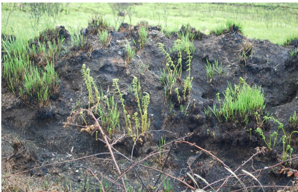
Bracken responds rapidly to fire, having deep complex root systems. This growth has taken place only two weeks following burning.

6.12 Bracken spread will be further stimulated by burning, and controlled burning of dead bracken is notoriously problematic, due to its high flammability. As such, bracken should not be controlled using fire. Where bracken is an issue for grazing management, mechanical / chemical control measures should be employed.