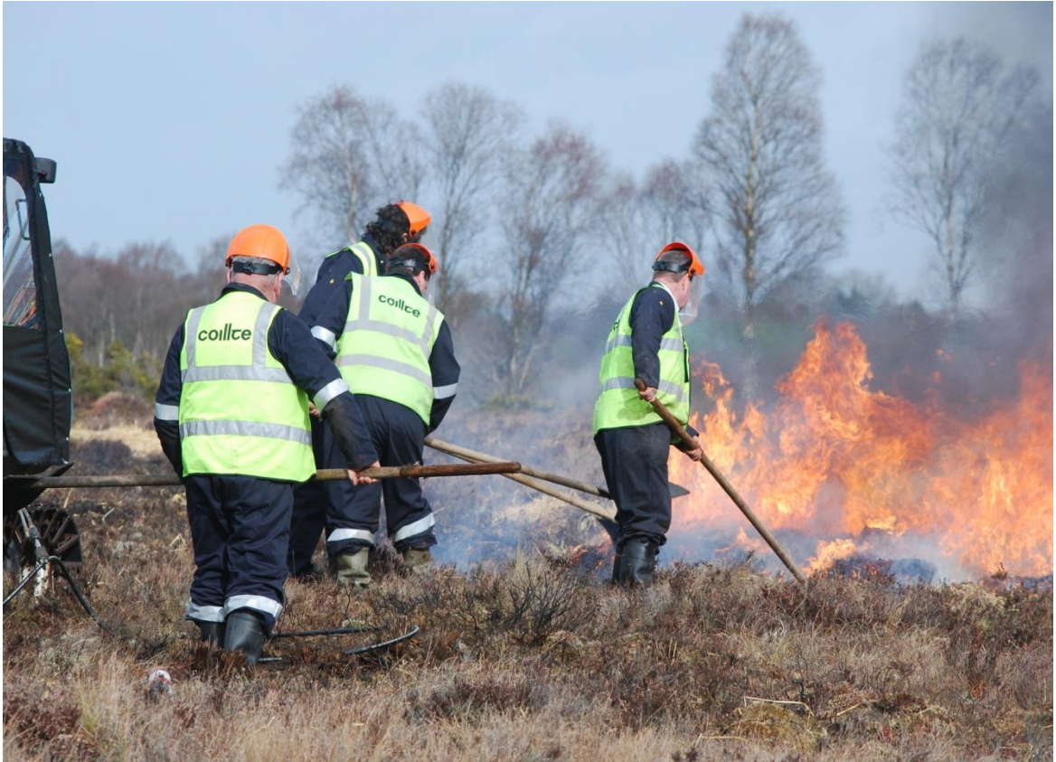
Prescribed burning requires sufficient manpower if it to be accomplished safely and correctly.

Co-operation between neighbours is vital in implementing effective burning. Neighbours should work together and share manpower resources to best effect. Remember the ' Meitheal ' ways of old. As in the past, landowners should organise Meitheal groups for prescribed burning in conjunction with neighbours.