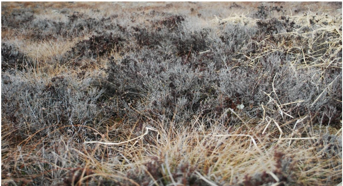
Fine Fuels, such as heather, mosses, gorse and grasses largely define the intensity of a fire, in conjunction with wind and moisture conditions.

The most critical types of fuels for fire management are fine fuels, such as grasses, heather foliage, mosses etc. and dead material (necromass). Typically fine fuels are defined as being less than 6mm ( \frac{1}{4} inch) in diameter. Due to their fine nature, these fuels can rapidly absorb or release moisture, depending on prevailing weather conditions, hence the importance of relative humidity in determining prevailing wildfire risk. Typical fuel species encountered in Irish upland conditions include Heather ( Calluna vulgaris ), Bell heather ( Erica cinerea ), Gorse ( Ulex europaeus , Ulex galii ), Purple Moor Grass ( Molinia caerulea ), Deer Grass ( Trichophorum caespitosum ), Bracken ( Pteridium aquilinum ) and Rush species ( Juncus spp. ). In most upland habitats, heather will be the preferred species for biodiversity and game development, and is makes for better winter sheep grazing.