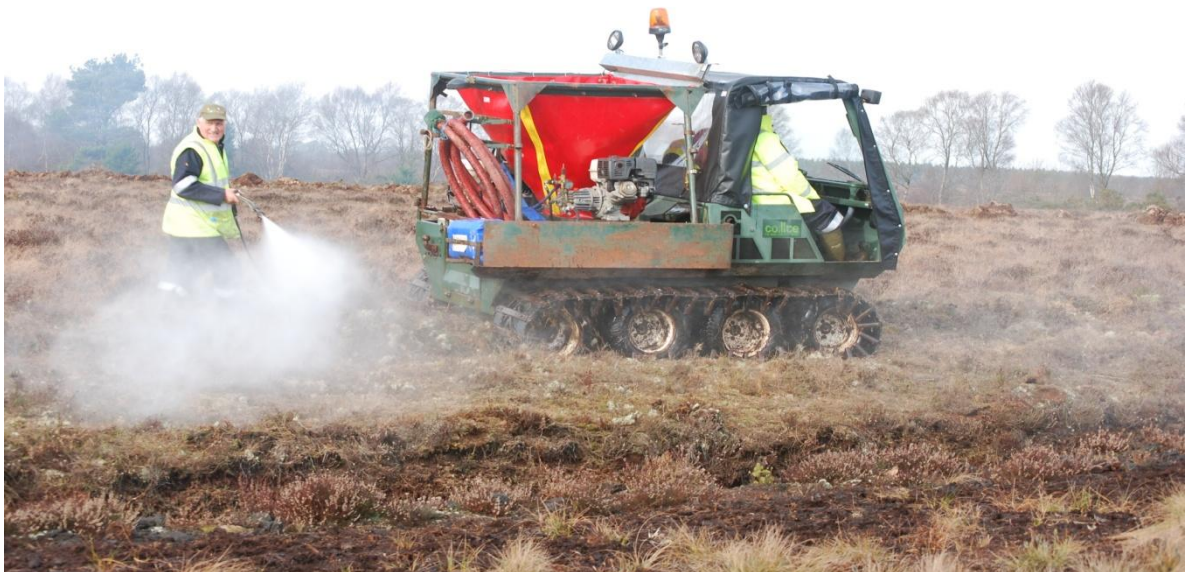
High pressure pumps, such as pressure washers can be mounted on ATV's or tractors and make short work of laying down control lines using water.

Portable water pumps or pressure washers mounted on a 4X4, tractor, ATV or quad bike can be used to wet down vegetation or extinguish unwanted fires. Petrol driven pressure washers are ideal for use as improvised foggers. Fine high pressure sprays use water more efficiently than coarse sprays or water jets, and can also be used to cool coarse fuel fires to within controllable limits.