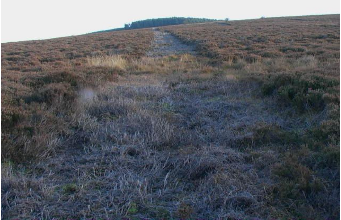
Mechanically prepared firebreak (Flail Mown) in extensive upland Heather terrain

For optimum control to be implemented, not more than 0.5 of a hectare (about 1.25 acres) should be burning within control lines at any one time, in order to minimise smoke and maintain fire control, particularly in upland grassland situations. Individual fires must be supervised at all times.