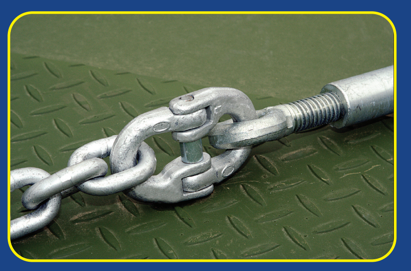
For further information on Load Securing see www.hsa.ie