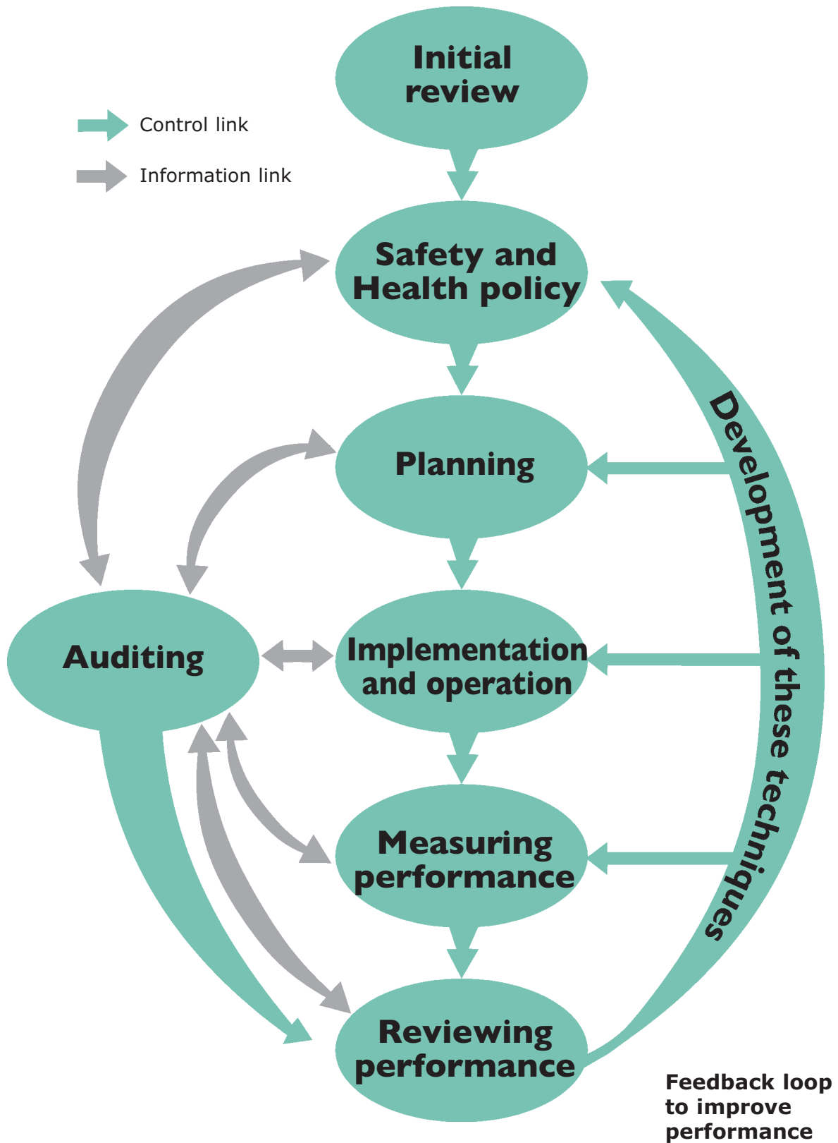
DIAGRAM 1: KEY ELEMENTS OF A SAFETY AND HEALTH MANAGEMENT SYSTEM