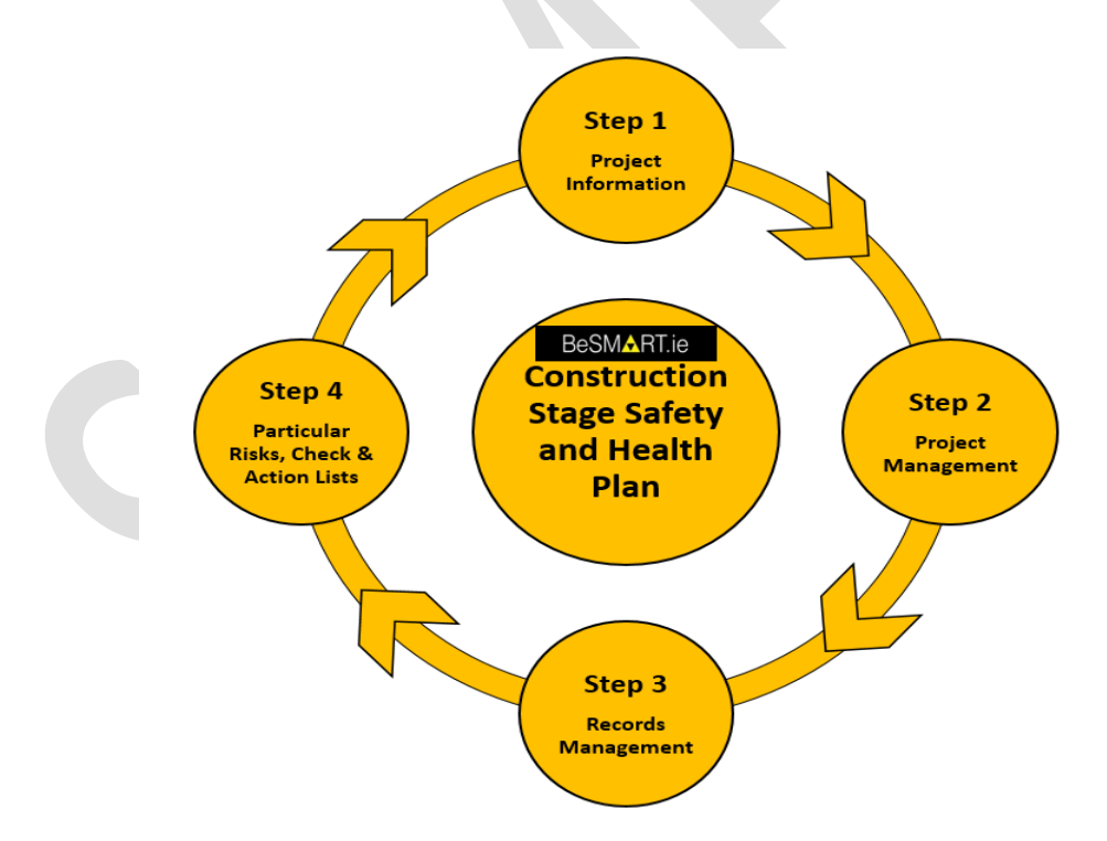
Figure 1: Construction Stage Safety and Health Plan - 4 Step Process

This Construction Stage Health and Safety Plan a 4-step process: