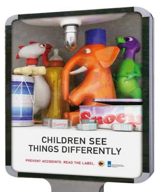
Image taken with permission from the Dutch safety campaign 'Children see things differently'