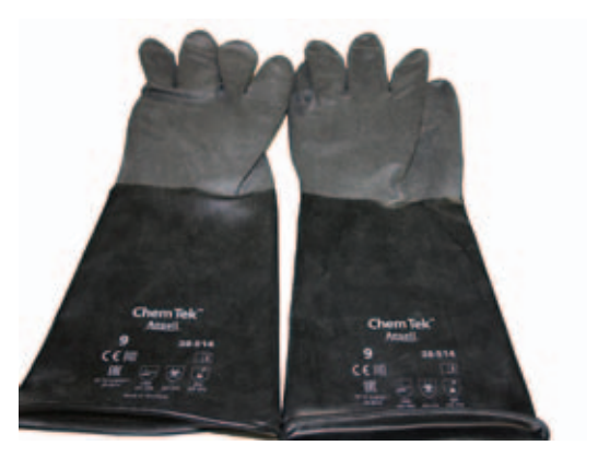
Butyl/viton glove with CE marking