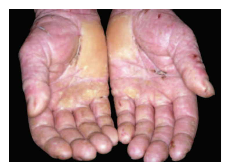
Dermatitis on worker's hands

Further information is available in manufacturers' charts, which indicate properties and performance details of the differing gloves to help make an informed decision on glove selection.