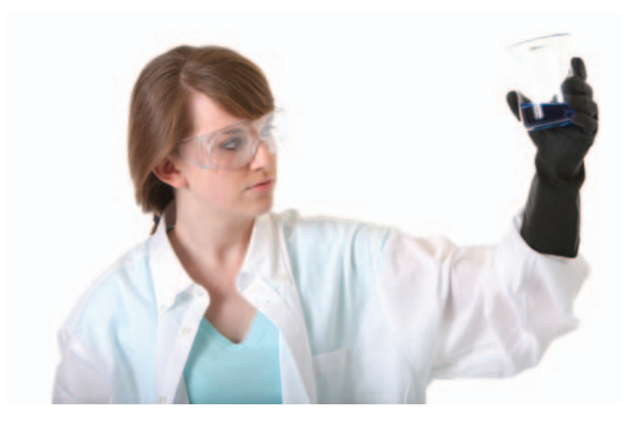
Heavyweight chemical latex glove

It should be noted that permeation and degradation tests are carried out under laboratory conditions and that real life working applications will vary. Gloves should be removed and disposed of according to manufacturer's instructions.