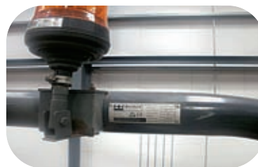
Identity plate on ROP's showing CE mark

Once the machine selection is made then it is essential to ensure that the plant machinery being used is in safe working order. Many accidents are caused due to defects with safety critical components of plant machinery. Common defects which occur on site dumpers include: