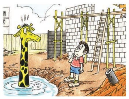
You cannot tell the depth of a hole if it is full of water

Water Safety Information is translated into Irish, Belarusian, Chinese, Czech, Latvian, Lithuanian, Polish, Romanian and Slovakian.